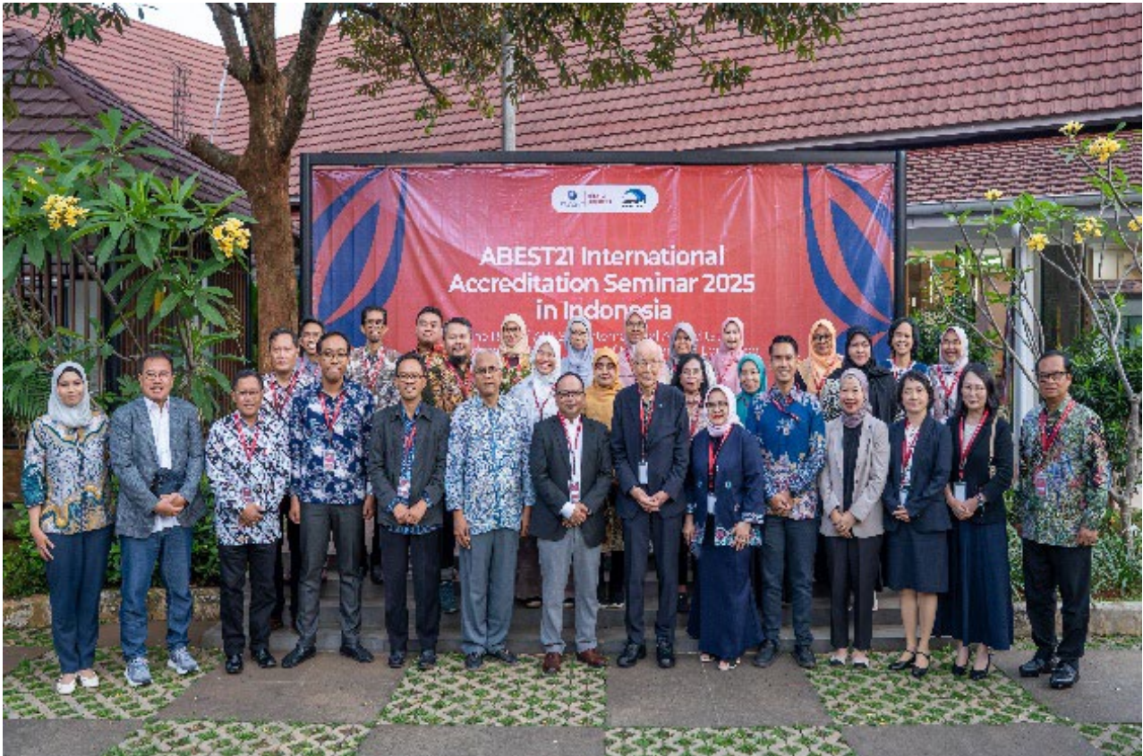
School of Business, IPB University, Bogor, Indonesia

"The Role of ABEST21 International Accreditation in Advancing the Globalization of Management Education."