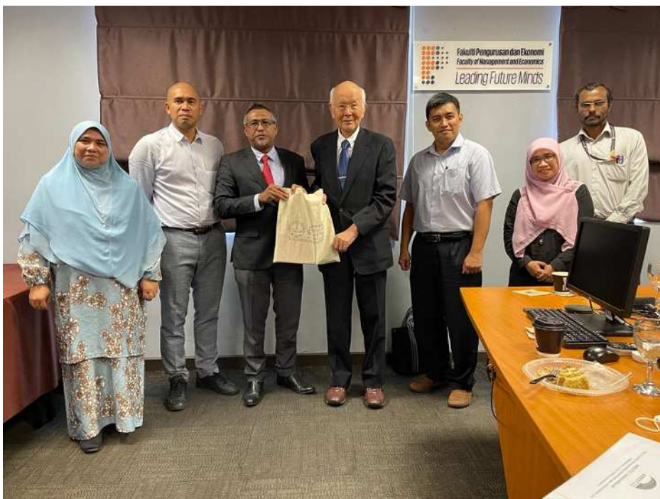
Visit to Faculty of Management and Economics, Universiti Pendidikan Sultan Idris, Malaysia on June 28, 2022.

With "Leading Future Minds" as its motto, the Faculty of Management and Economics is determined to become a leader in the field of education specializing in business, management, economics and accountancy. We hope that by joining the Alliance of Business Education and Scholarship for Tomorrow, a 21 st Century Organization (ABEST21), we will move closer to our aim.