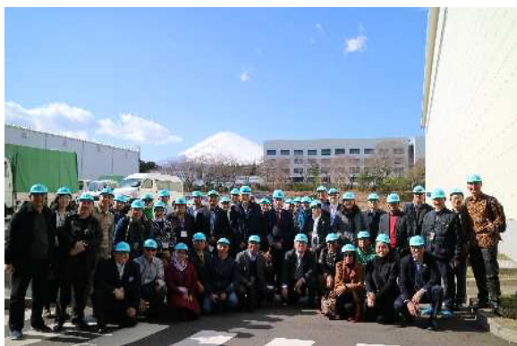
The Gotemba Plant, Toshiba Machine, Co.,Ltd.