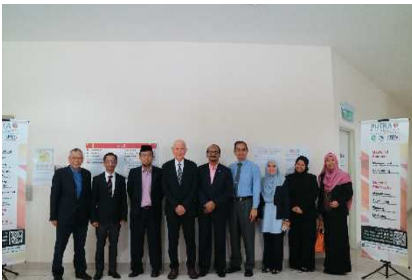
The Inaugural General Meeting of the Malaysia Council for Nurturing Global management Professionals