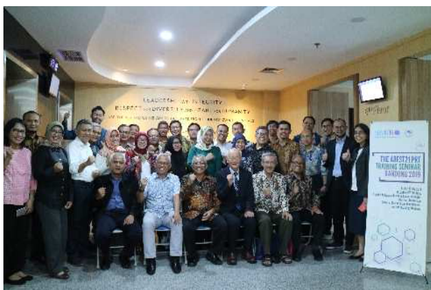
The Inaugural General Meeting of the Indonesia Council for Nurturing Global management Professionals