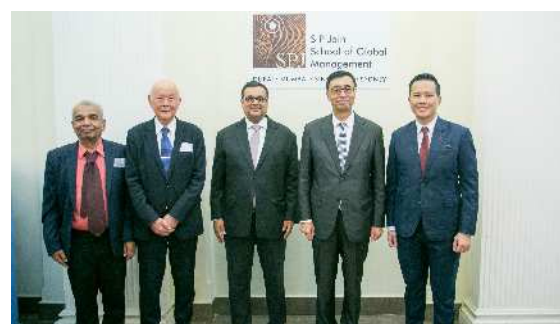
山崎純特命全権大使と SP Jain 執行部