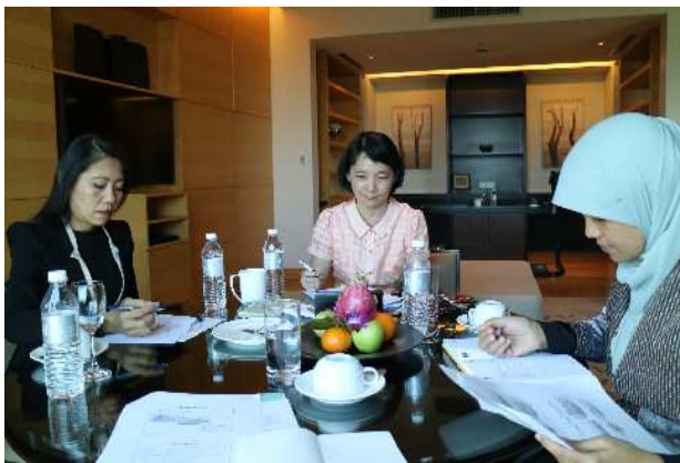
Project No. 8 Research Committee meeting