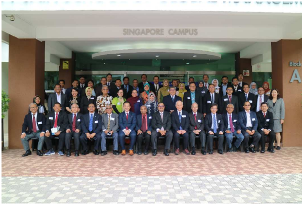
The ABEST21 Peer Review Committee at SP Jain School of Global Management, Singapore