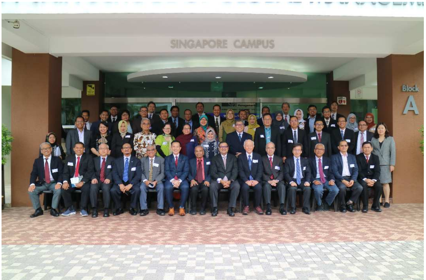
ABEST21 Peer Review Committee 18-19 November 2019 at SPJain School of Global Management, Singapore