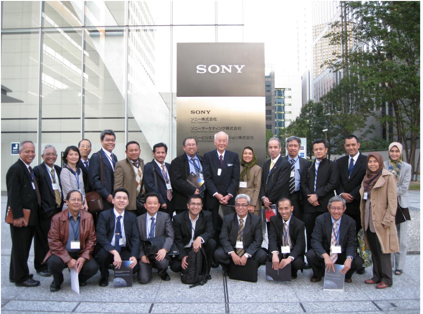
Sony Corporation (November 2, 2012)

URL: http://www.abest21.org TEL. 03-3498-6220 E-Mail: ABEST21@abest21.org